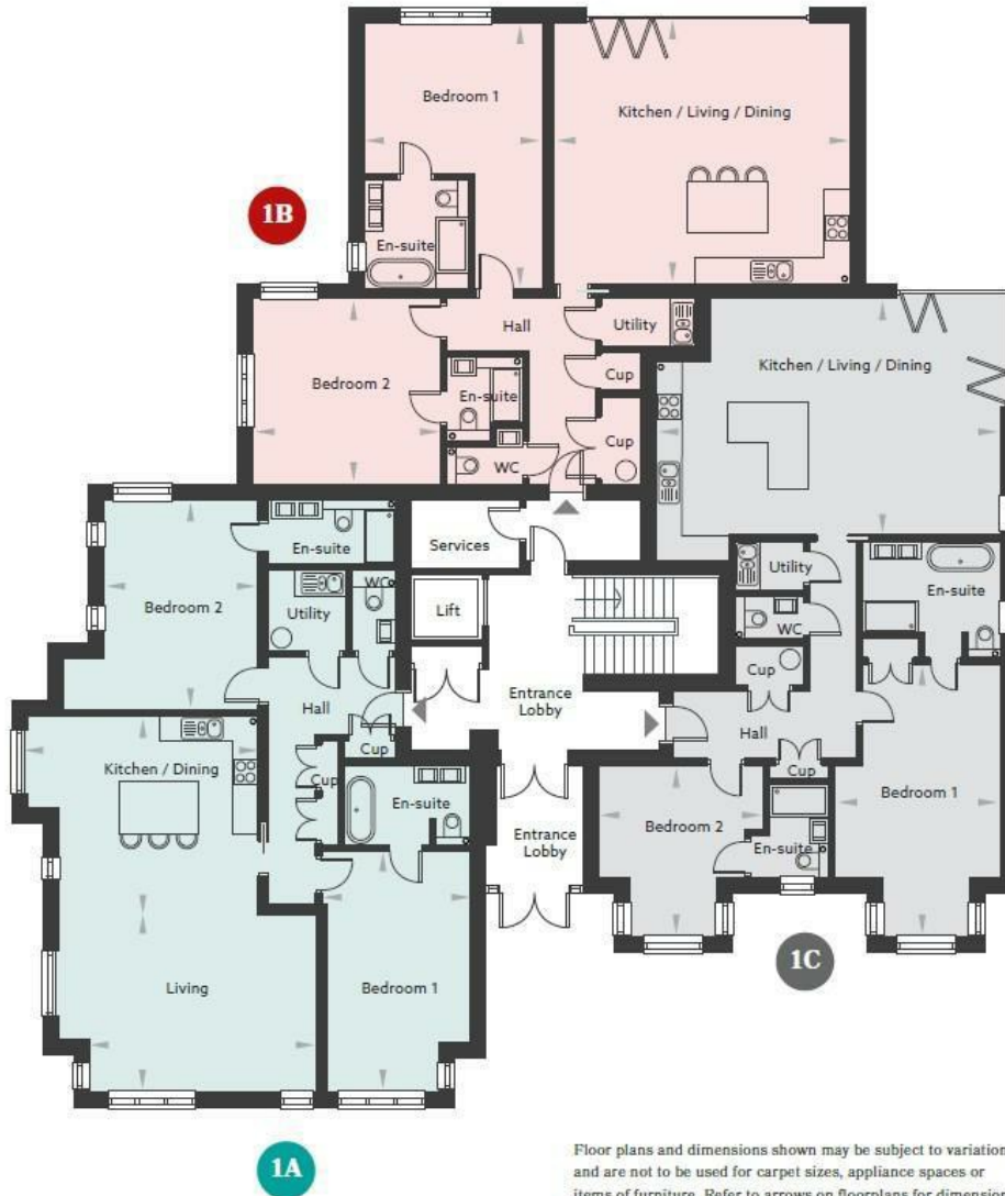
Floor plans and dimensions shown may be subject to variation and are not to be used for carpet sizes, appliance spaces or items of furniture. Refer to arrows on floorplans for dimensions